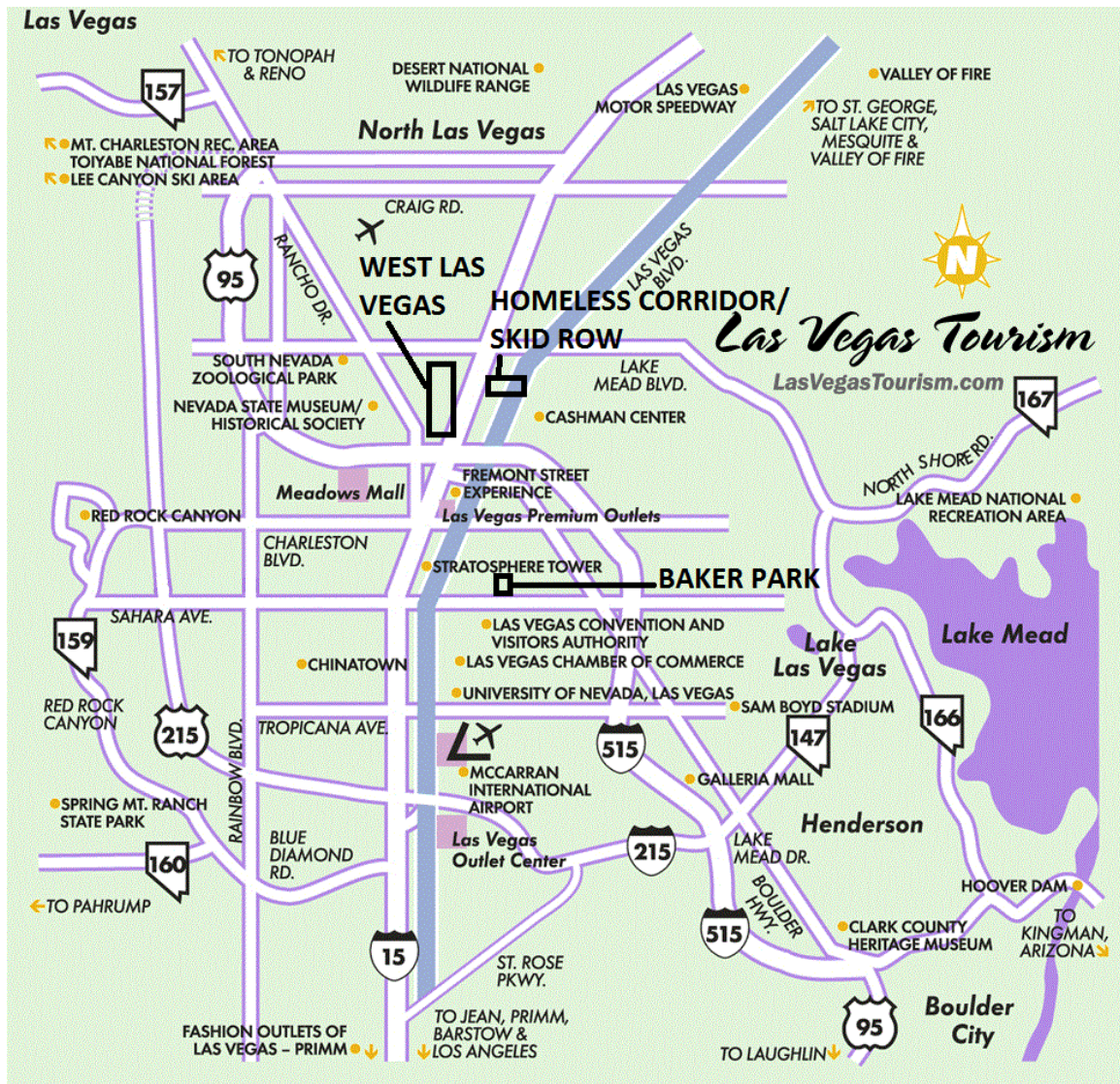
Fig 1.2: Food sharing sites in Las Vegas, in the context of sites of capital accumulation and leisure

Project Aqua, on the other hand, was more spatially flexible. Their activities were carried out in multiple places within two particular neighborhoods. The first was in and near the city's "Homeless Corridor" area – also known by locals as Skid Row. This area is located a couple miles north of downtown Las Vegas and is predominantly populated by the city's largest homeless and emergency shelters, located on or off of Foremaster Lane