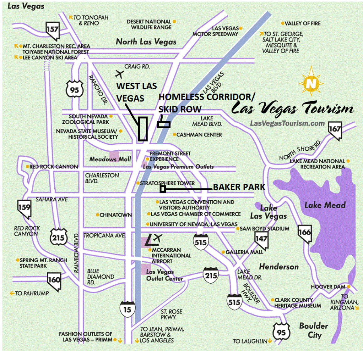
Fig 2.1: Spaces of capital accumulation and food sharing in Las Vegas.

It is perhaps clear and intuitive from a political economy point of view why crackdowns on street-feeding and food sharing occurring in visible, contested spaces might be a matter for policymakers' attention. Among local officials, traditional understandings conceptualize the homeless as visible signs of trouble, usually in areas that are being marketed as desirable. Moreover, the presence of visible homelessness in conspicuous urban spaces serves as a visible reminder of severe and entrenched inequalities; the